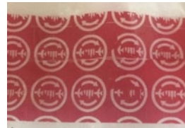
Result of being attacked with heat elements below 70°C