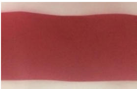
Perfectly sealed condition