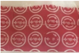
Result of being attacked by Freon/cold spray